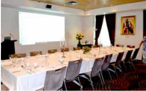
Ian Potter Room

Graduate House continues its longstanding tradition of excellent service by providing organisations with modern academic meeting facilities. Our packages ( https://www.graduatehouse.com.au/meet-here/meetings-and-functions/ ) are tailored to suit all types of functions, both formal and informal.