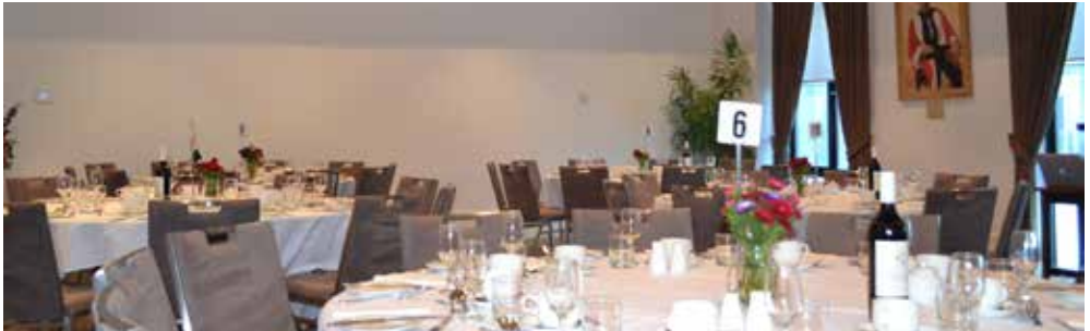
Combined Ian Potter & Stillwell Room