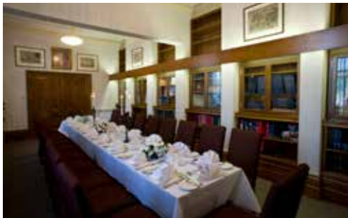
The Johnston Library Formal setting