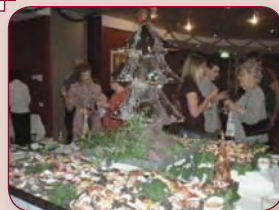
A splendid seafood smorgasbord