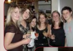
Residents enjoy the evening