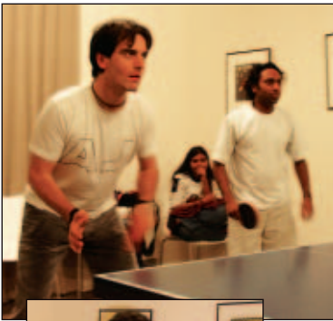
TABLE TENNIS TOURNAMENT

Erwin is also an avid basketball fan but is quickly learning to appreciate the nuisances of AFL, rugby and cricket since his move to Australia.