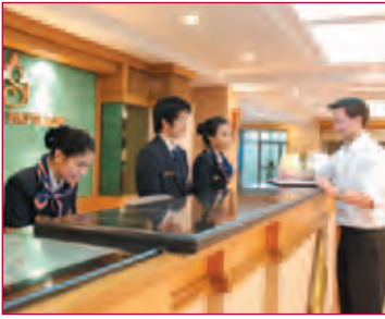
Lobby and Foyer area